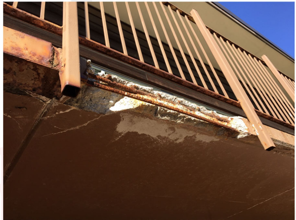
Concrete deck needs immediate repair