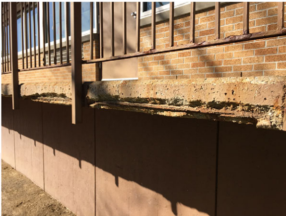
Classroom egress deck corroded