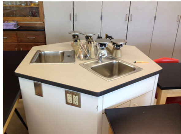
Science lab does not have water available