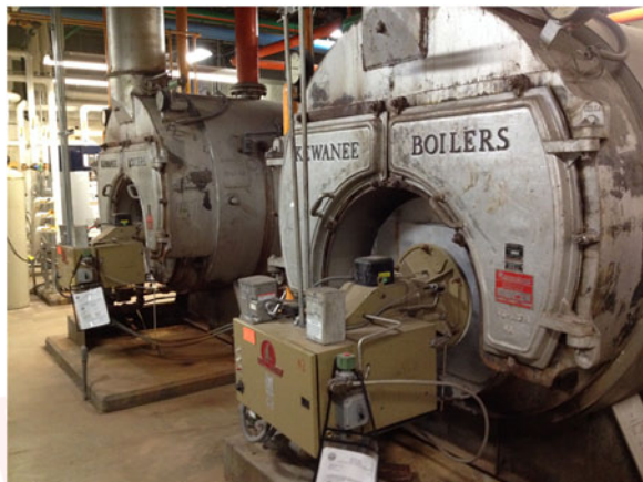
Boilers past useful life—need replacement