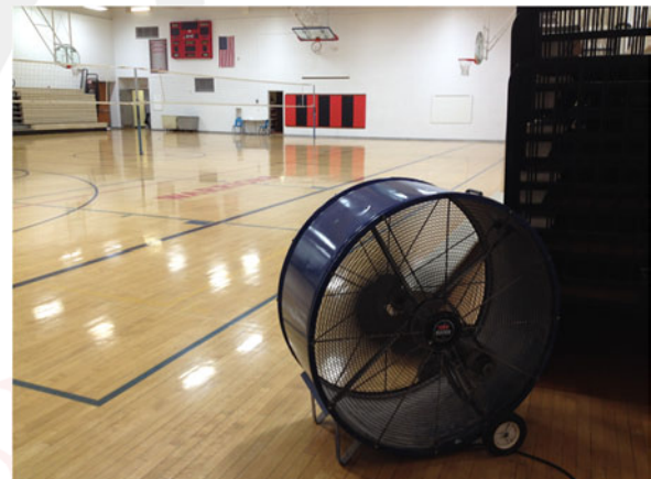
No air conditioning in gym