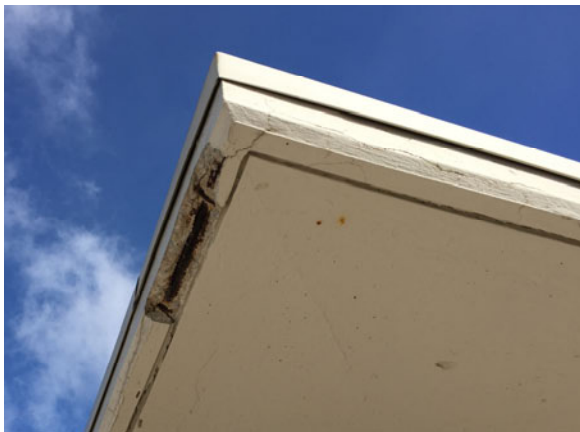
Deteriorated concrete soffit with exposed rebar