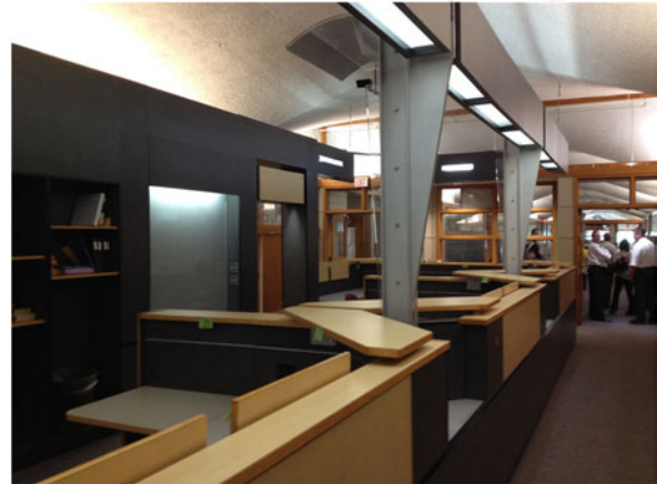
Several under-utilized common areas between classrooms could be converted into collaborative space