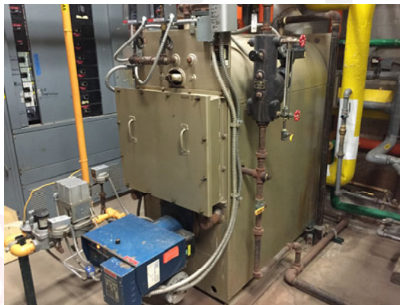
Boilers past useful life