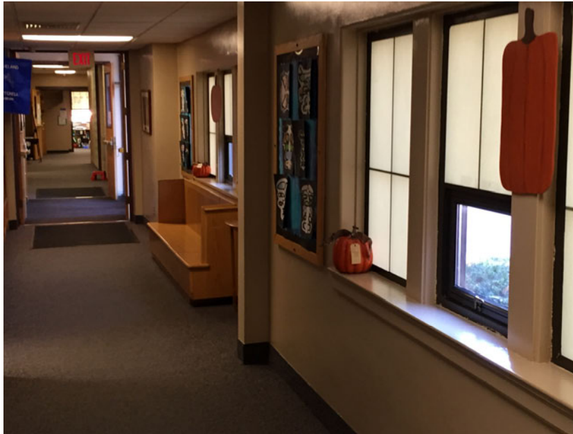
Entrance corridor provides poor access control and visibility from office.