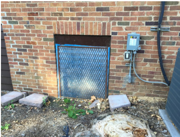
Outside air intake—requires replacement