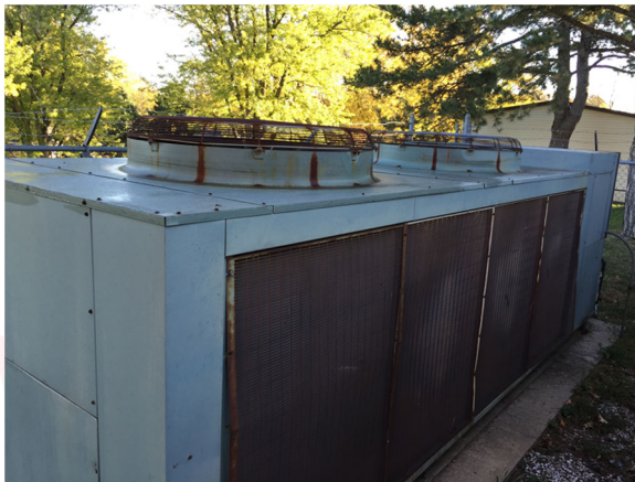
HVAC condensing unit is at end of expected life