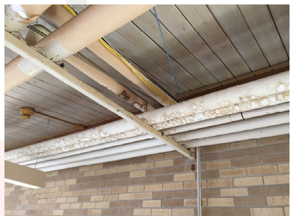
Exposed piping in hallway with condensation damage