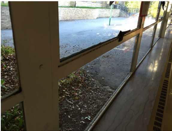
Single pane windows need to be replaced.